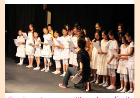
Our dance troupe sang "I am Australian" together at the end of the Youth Concert