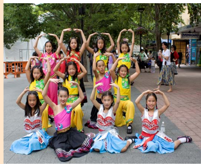
The young dancers of "Half moon rising"