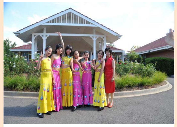
The young dancers and their choreographer at the Carey Garden Nursing home