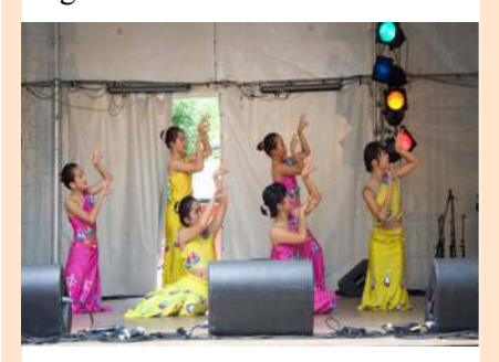
The peacock dance performed by the ACCEPA dance group at the 2010 Chinese New Year Celebration

The elegant peacock dance is the crystal of Dai people's wisdom. In May 2006, the peacock dance was listed as the first National Grade Cultural Heritage.