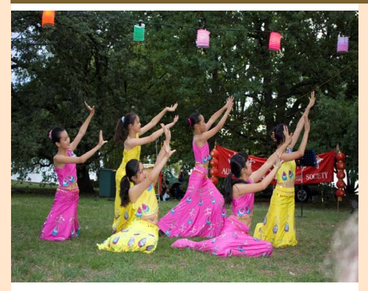
"South of colourful clouds" at the Lantern Festival