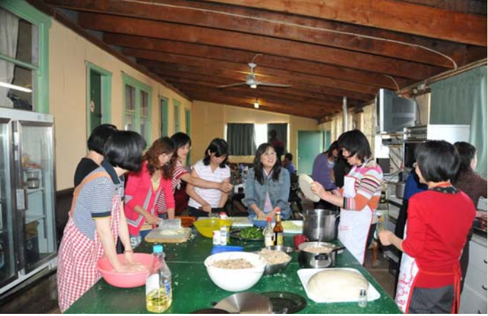
Ladies are making dumplings together