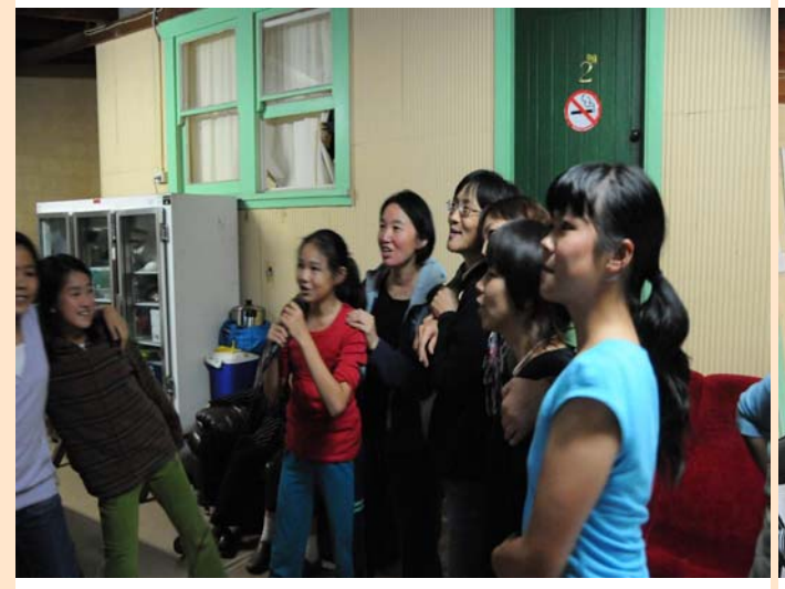
Children and parents are happily singing karaoke