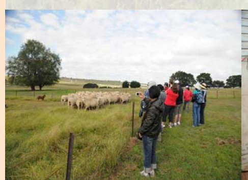
We are watching the performance of the sheepdog

The dedicated work of the committee members has received a positive feedback. Many participants commented that they thoroughly enjoyed the food, the activities, and the opportunity of meeting people and making friends during the farm stay.