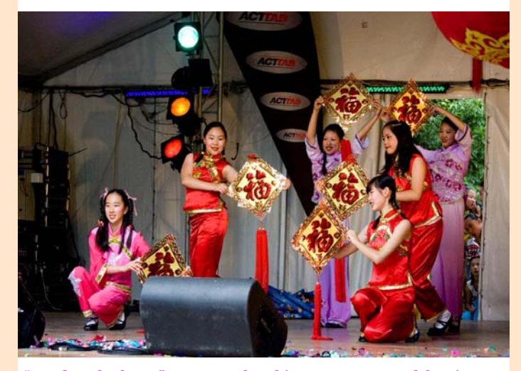
"Good Luck Charm" Dance at the Chinese New Year Celebration