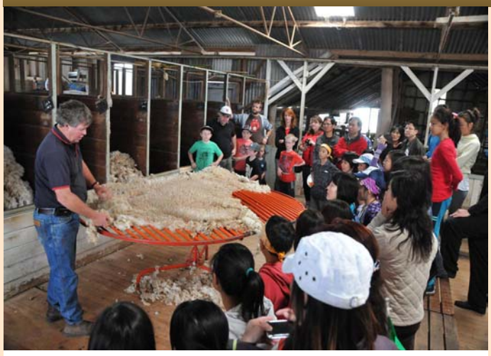
The farmer is talking about the classifications of the wool