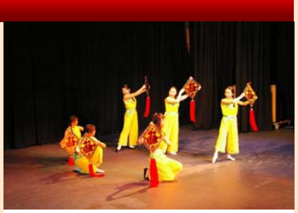
"Good Luck Charm" performed by the ACCEPA dance troupe