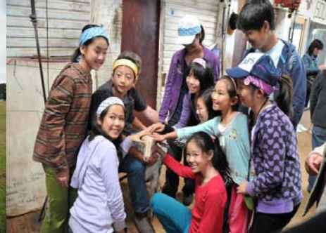
Children are having photo with the sheared sheep