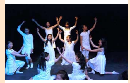
The modern dance "Notebook" performed by the ACCEPA dance troupe